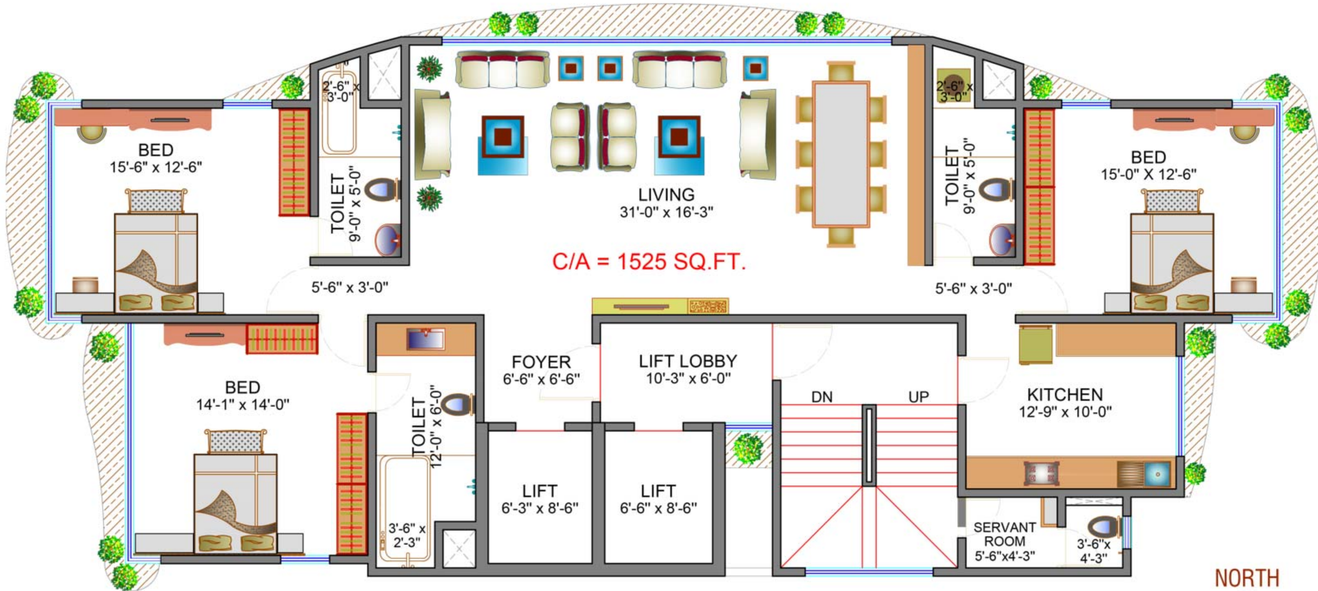
11 & 12 FLOOR PLAN